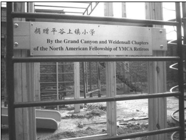
Left: The commemorative plaque honoring the Grand Canyon and Weidensall Chapters for their gift.