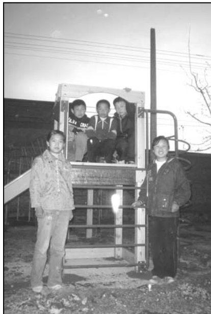
Above: Children play on the gym set provided by NAFYR members.