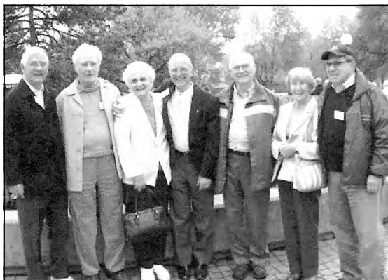
during the Copeland-Budge Chapter Ottawa Excursion.