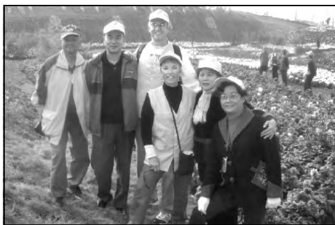
The Chengdu YMCA Bicycle Club

I would strongly urge any couple who would be slightly interested about volunteering to get more information. It is one of the greatest adventures that we have ever had.