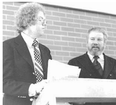
Stan Freberg and Peter Ustinov appear at a YMCA event in 1972

Lloyd Bridges and his wife would always be there to help set up and take down the decorations for our dances. In 1960, two of my Hi-Y members from the West Los Angeles YMCA kidnapped Frank Sinatra Jr. in Lake Tahoe. They both served a seven year prison term at Folsom Prison. When I was General Director of the Anaheim Family YMCA in 1970, I was able to secure a $1,175,000 gift for the second phase of our Capital Campaign. At that time I was told that was the largest single gift to any YMCA in the nation. How I did enjoy those 26 years.