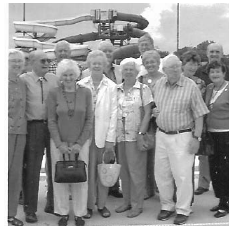
Central Atlantic members at outdoor swimming area.