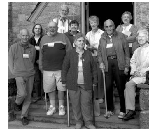
Members of the Ellenwood Chapter in front of the Chapel at Silver Bay.

bills that are in the state legislature and representing the Y in encouraging legislators to vote for or rejecting bills pertinent to the Ys purpose. Walt Price reported on the National Board meeting, the new dues structure and by-