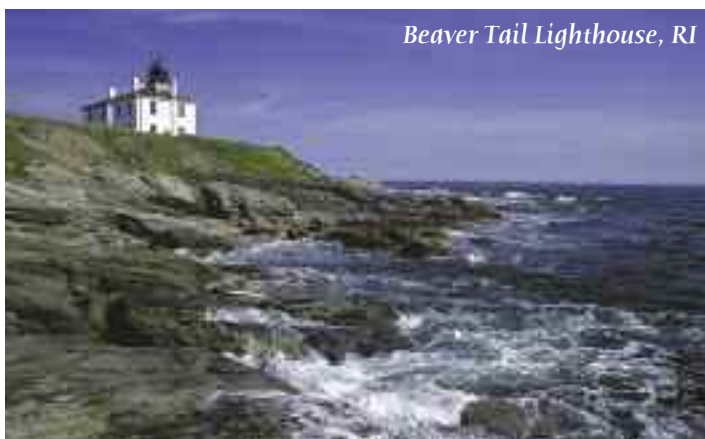
Beaver Tail Lighthouse, RI