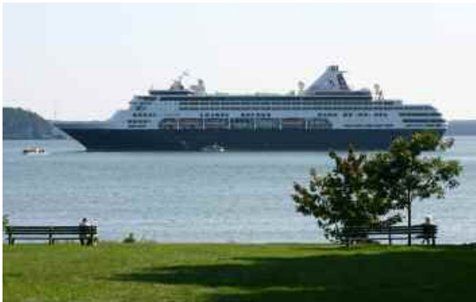
Clockwise from top left: Leaving Boston, Bar Harbor, Peggy's Cove, House of Anne of Green Gables, The Maasdam