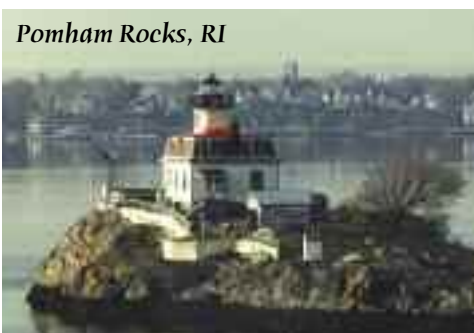
Pomham Rocks, RI

Rhode Island, smallest of the 50 states, is densely populated and highly industrialized. It is a major center for jewelry manufacturing. Electronics, metal, plastic products, and boat and ship construction are other important