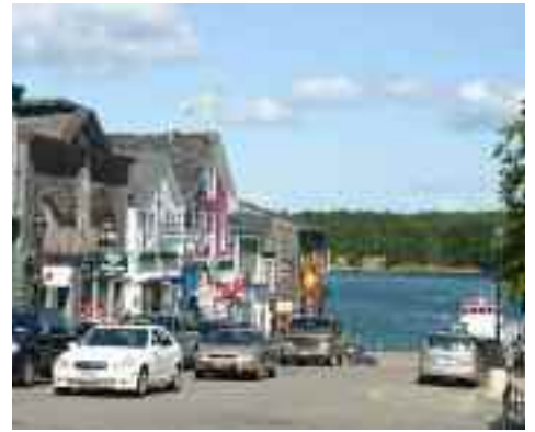
Clockwise from left: Lighthouse at Peggy's Cove, Bar Harbor, Chateau Frontenac, Prince Edward Island, Church on Prince Edward Island, Peggy's Cove