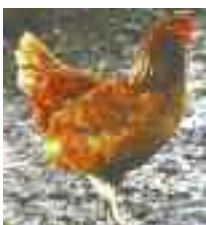
Rhode Island Red, Rhode Island State Bird

Ellen & Greg Fairbend 28 L'Hermitage Drive Shelton, CT 06484