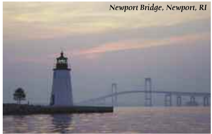
Newport Bridge, Newport, RI