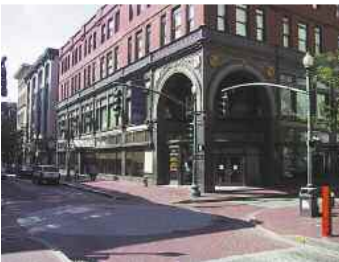
Shepards Dept Store, Providence, RI